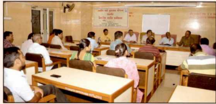
Bimonthly Training Programme under Training & Visit Scheme held at JAU, Junagadh on August 4-5, 2016