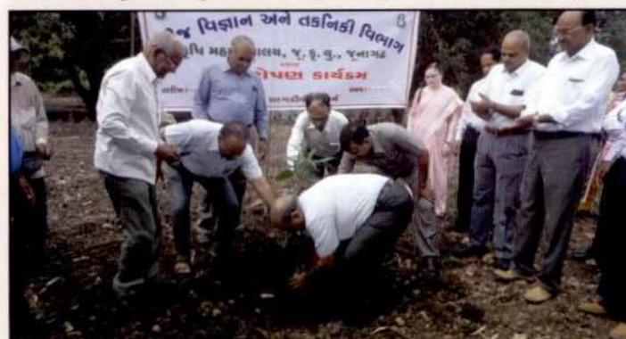
Tree plantation at Sagdividi Farm