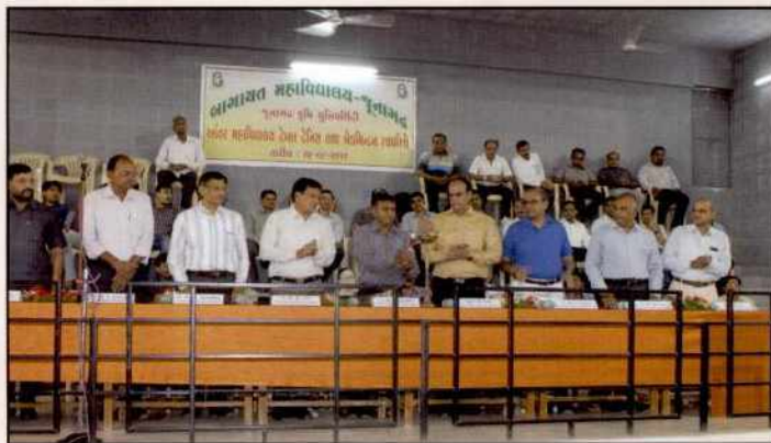
Inauguration of Inter-Collegiate Badminton & Table tennis tournaments