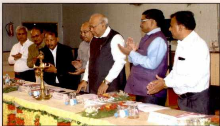
Inauguration of National Workshop on Pomegranate