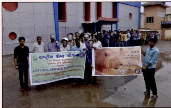
Participation of students of College of Fisheries, Veraval in the celebration of "International Lion Day" on August 10, 2016