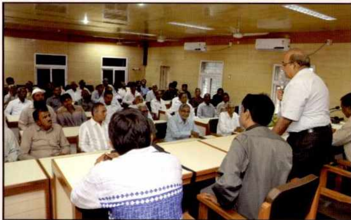
Farmers' training programeme (July-September, 2016) at SSK

Total 24 on-campus training programmes were conducted by the Sardar Smruti Kendra during July to September 2016, wherein 593 farmers and 414 farm women participated from all over Gujarat. The exposure visit on "Study of the latest technology on water efficient irrigation system" was organized by Director of Agriculture, Government of Tamil Nadu for the farmers of Tamil Nadu from September 2-8, 2016 by Sardar Smruti Kendra, JAU, Junagadh. A similar exposure visit was also organized for the farmers of Sabarkantha.