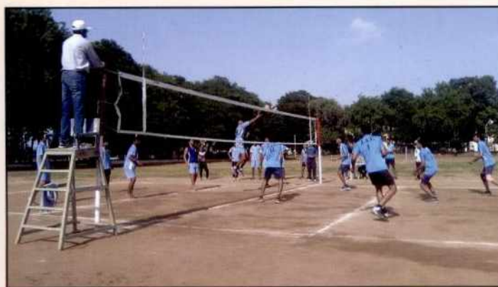
JAU secured the second position at Inter Agricultural University Volleyball, Basketball and Badminton tournaments organized at AAU, Anand (September 27-28, 2016)