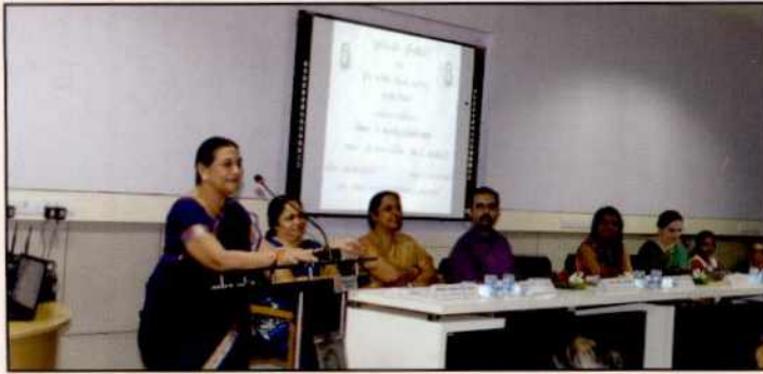
Health Awareness Programme on "Perception on Psychiatric disease (Mansik RogoniSamaj)"