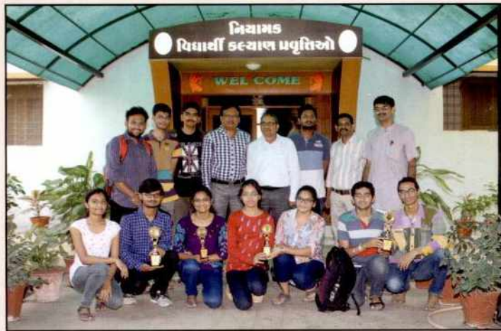
Participants of NSS Day at Sardar Patel University, Vallabh Vidyanagar