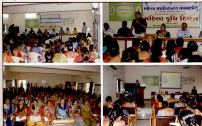
Celebration of Mahila Krushi Divas at KVK, Jamnagar