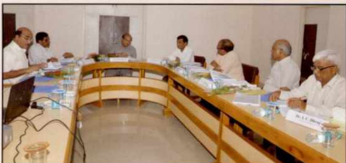
28 th Meeting of Extant Variety Recommendation Meeting held at JAU, Junagadh on July 20, 2016