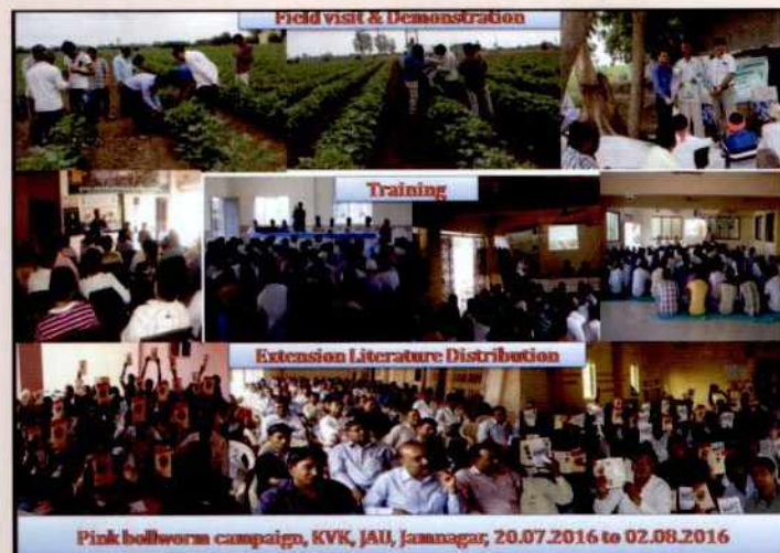
Pink Ball Worm campaign by KVK, Jamnagar

Krishi Vigyan Kendra, JAU, Jamnagar celebrated pink ball worm campaign during July 20 to August 2, 2016. This campaign was conducted by 11 training programmes for farmers and 7 training programmes for agro-input dealers and extension functionary for the management of pink bollworm in cotton. Total of 614 farmers, 622 Agro-Input Dealers and Extension Functionaries were benefited.