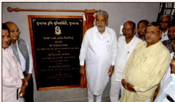
Lokarpan ceremony of "Riddhi Girls Hostel"