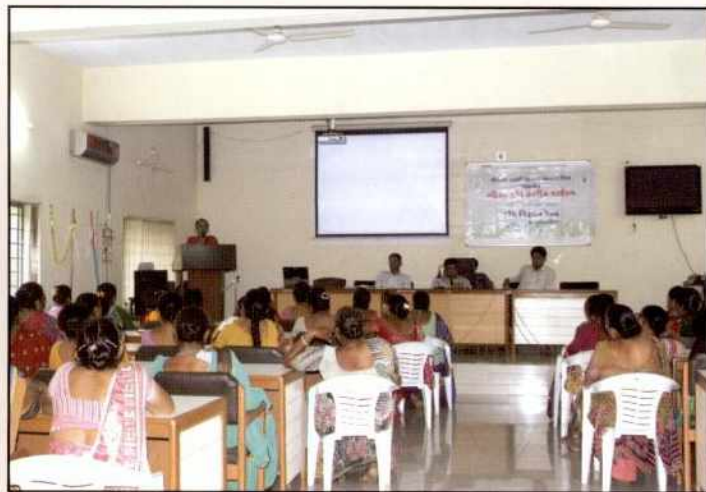
Celebration of Mahila Sashaktikaran Day at Targhdiya