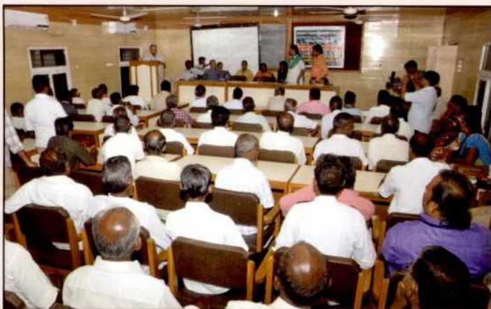
Exposure visit of Tamil Nadu Farmers