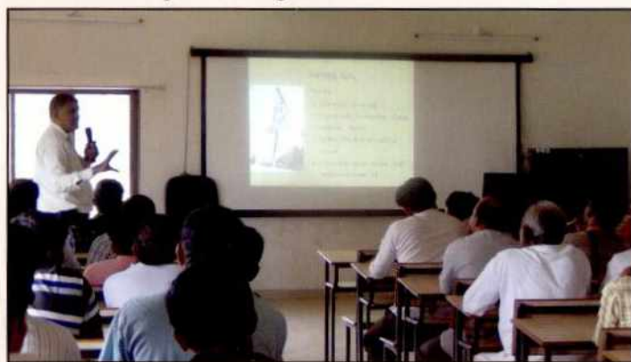
Training Programme on coconut farming

farmers to teach them hybridization technique for production of DXT (Mahuva); and also the visit of coconut nursery, Elite farm & mother plot was organized.