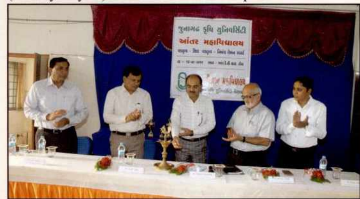
Inauguration of Inter-Collegiate Debate and Essay Competitions