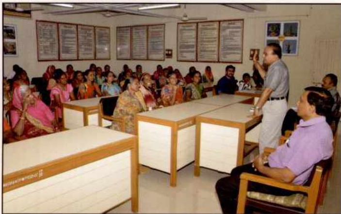
Farm women's training programeme (July-September, 2016) at SSK