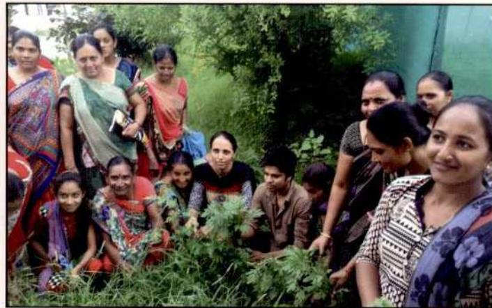
Celebration of parthenium week at Targhdiya

During July – September 2016, various KVKs (Amreli, Khapat, Jamnagar, Nana Kandhasar, Pipaliya and Targhdiya) organized a total of 152 training programmes, wherein 4532 farmers and 596 farm women and 1719 extension personnel participated. KVKs made 127 diagnostic visits, 179 Field visits and organized 31 Khedut Goshties. Total of 6509 Farmers visited KVKs, whereas KVK scientists visited 180farmers' fields.