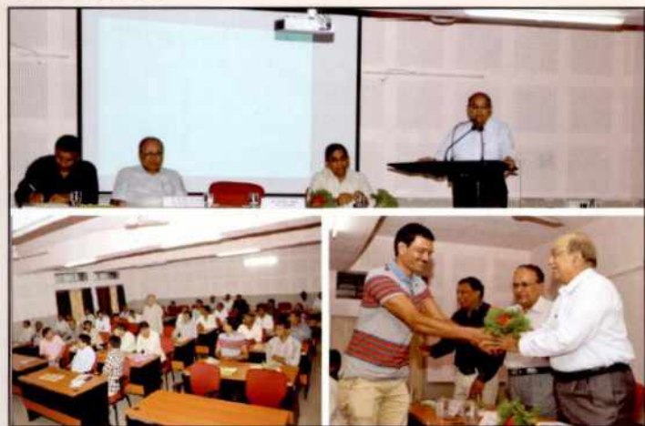
Training Programme on Rejuvenation in Mango