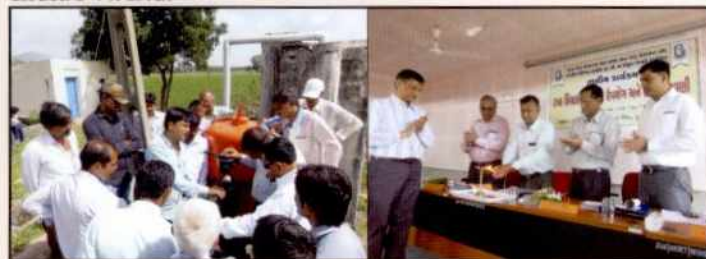
Training Programme on “Use of drip irrigation and its maintenance”