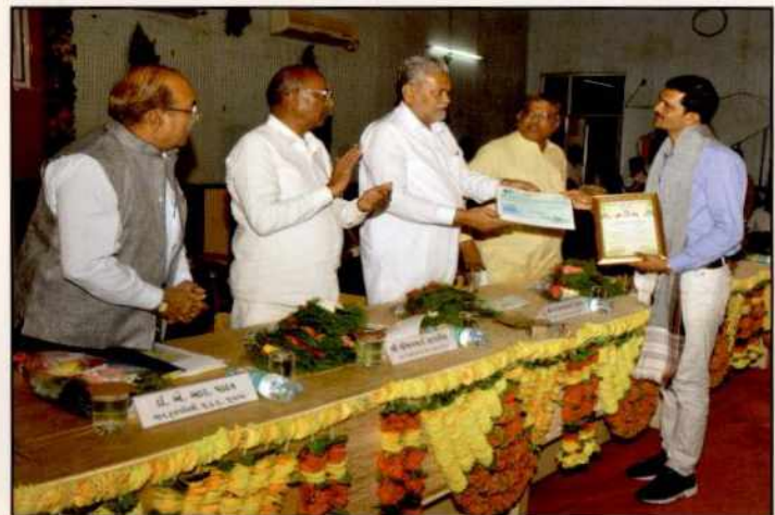
Sardar Smruti Kendra Rajat Jayanti Award Ceremony