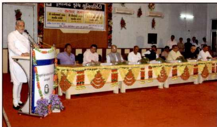
Shri Parsottambhai Rupala, Hon'ble Minister of State in the Ministry of Agriculture and Farmers Welfare, Government of India, New Delhi addressing the faculty of JAU, Junagadh