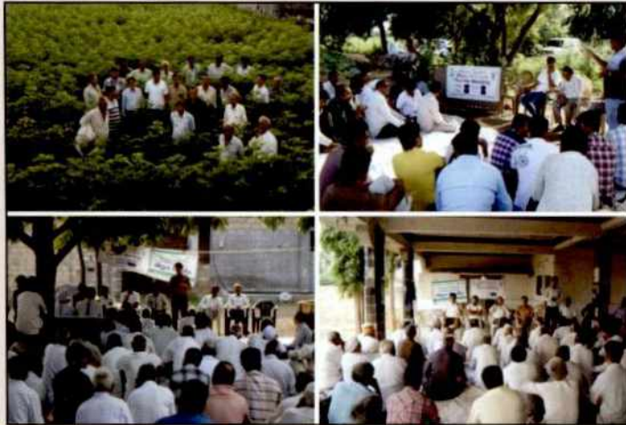
Farmers' meeting in adopted villages under Mera Gaon Mera Gaurav

As per instruction of ICAR for implementation of Mera Gaav Mera Gaurav scheme, Cotton Research Station, JAU, Junagadh adopted 10 Villages of Junagadh District. To initiate the MGMG programme, a group of selected farmers from each village were invited and ice breaking interaction meeting was conducted at each village. There were 6 farmers' meeting conducted in which more than 312 farmers were benefitted. Scientists gave lectures on the innovative initiative of MGMG, integrated Pink Bollworm Management in cotton, integrated white grub management in groundnut, sucking pest management, irrigation, fertilization management improved cotton practices, and the importance of biological pest management especially cotton pink bollworm.