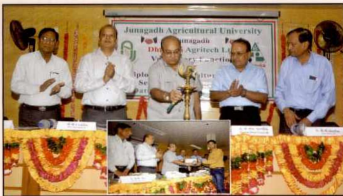
Certificate Distributing Ceremony for the participants of "Diploma in Agricultural Extension Services for Input-Dealers" on September 7, 2016