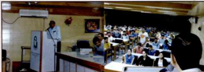
Orientation programme for newly admitted students