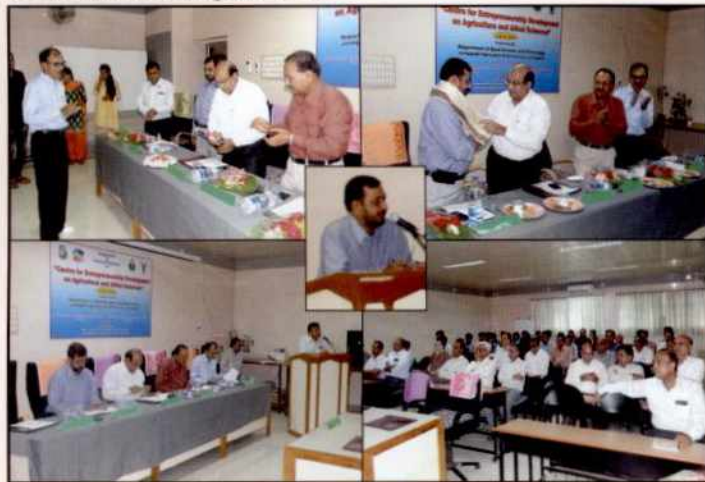
Inauguration ceremony of project on "Centre for Entrepreneurship Development on Agriculture and Allied Sciences"