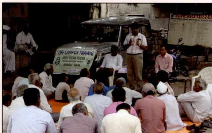
Off-campus training programme by KVK, Jamnagar