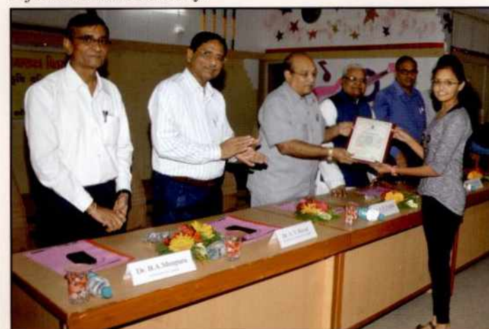
Provisional Degree Certificate Distribution Ceremony