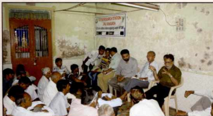
Farmers' night meeting by Cotton Research Station, JAU, Junagadh

In addition to that, More than 21 farmers' night meetings were conducted at different villages of Gondal and Manavadar Taluka, by the Cotton Research Station, JAU, Junagadh for the effective control of cotton pink bollworm. More than 896 farmers got benefitted.