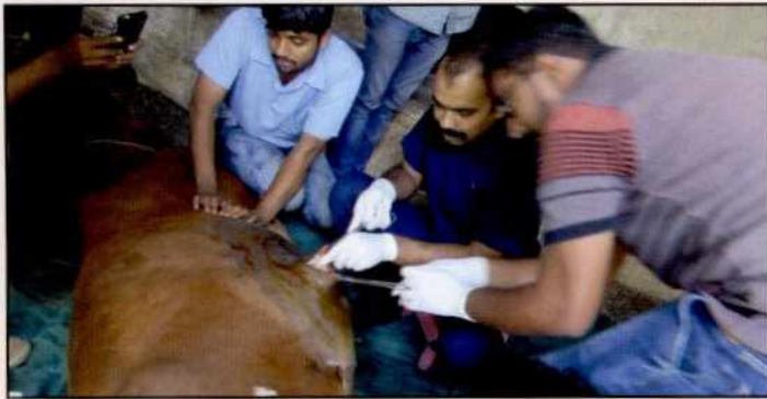
Clinical camp at Rajkot

A Veterinary Clinical Camp was organized by CoVS& AH, JAU, Junagadh in collaboration with Karuna Foundation Trust, Rajkot on September 29, 2016 at Rajkot. During the camp, one hundred eleven (111) animals were treated for different medicinal, surgical and gynecological ailments. Different species of animals of Rajkot and surrounding villages got specialized treatment from the expert staff members of the college.