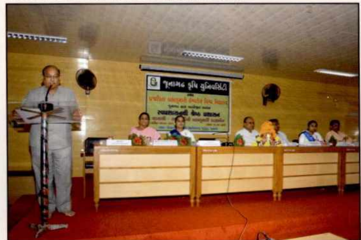
Lecture on "Excellent Administration through Self-Administration"